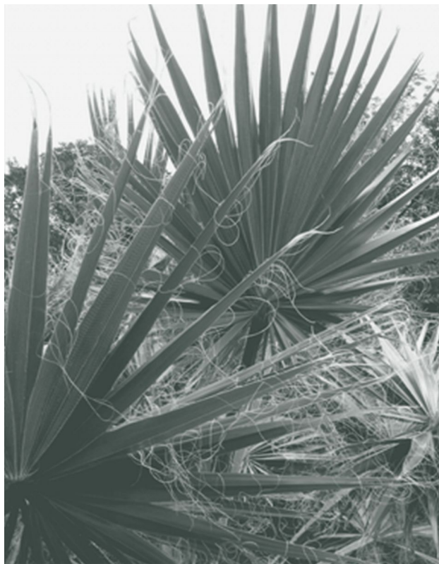
Figure 2. Washingtonia filifera leaves - note filaments hanging from leaf margins.

Palms are increasingly appreciated by consumers. Cold hardy palms are in great demand and the nursery industry is responding with additional production. Currently, palms that are most widely available are in the genera Butia (pindo palm), Chamaedorea (parlor palm), Livistona (fan palm), Phoenix (date palm), Rhapidophyllum (needle palm), Rhapis (lady palm), Sabal (palmetto), Serenoa (saw palmetto), Syagrus (queen palm), Trachycarpus (windmill palm), and Washingtonia (washington palm; Figure 2). Refer to Table 1 for specific species and their cold hardiness information. Other cold hardy palms may be found at better garden centers and specialty nurseries.